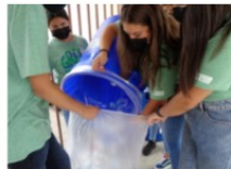
Green Team at Work

ASB wants to remind everyone that the Green Team collects empty plastic bottles every Thursday, during first period. So don't forget to leave your recyclables outside the classroom door.