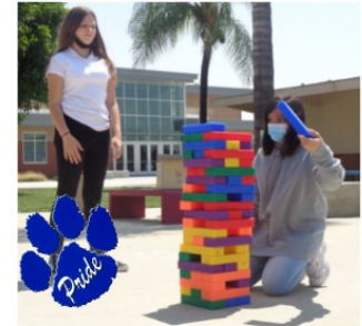
Students Having Fun at PBIS Lunch Activities